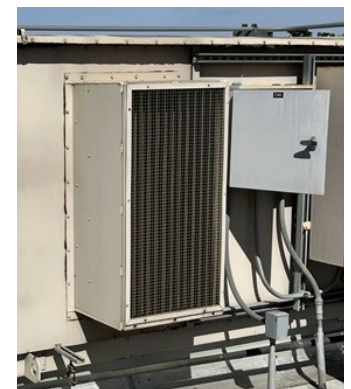
Left: An outdated airflow station (seen through the damper) clogged with dirt. Right: Modifications to the units were required to mount the old airflow stations externally.