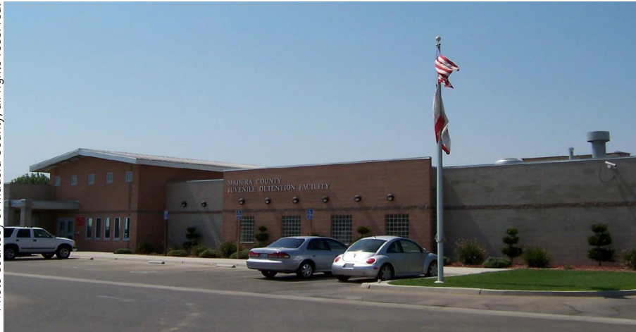
Madera County, committed to maintaining high IAQ standards, prioritized installation of reliable airflow measurement systems at its juvenile detention facility.