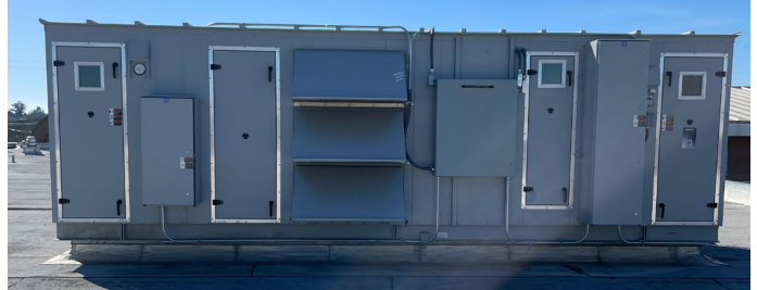
The versatile AFMS was easily installed in five retrofits (such as above) and one new unit (below).