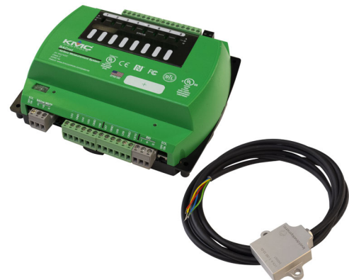
A BAC-5901C-AFMS (controller with inclinometer) is a core component of the AFMS.