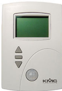
Air Changes per Hour (ACH) can be displayed from a wall-mounted NetSensor.